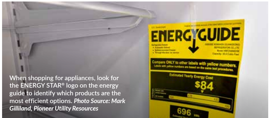
When shopping for appliances, look for the ENERGY STAR® logo on the energy guide to identify which products are the most efficient options.

If an energy efficiency upgrade requires improving the electrical panel in your home, there's a tax credit for that, too. You can receive 30% of the cost of the panel upgrade, up to $600.