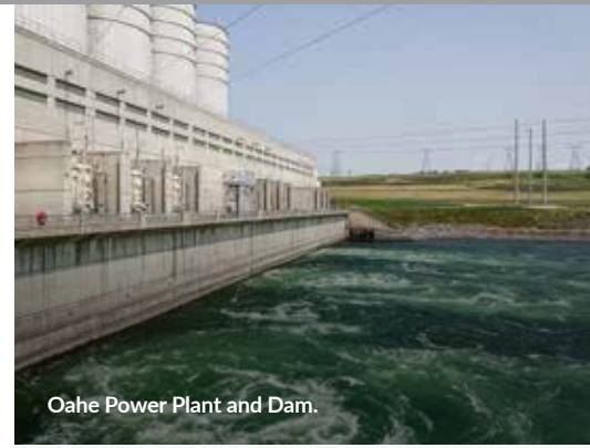
Oahe Power Plant and Dam.

Energy Trail Tour participants also learned about wind generation and renewable energy resources in America's energy mix. The tour provided a "mobile classroom" on the process of wind generation and how it contributes to an all-of-the-above generation mix that provides reliable and affordable energy to cooperative members.