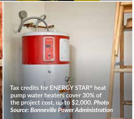
Tax credits for ENERGY STAR® heat pump water heaters cover 30% of the project cost, up to $2,000.

These federal tax credits are available through 2032. You must own the home you're upgrading, and it must be your primary residence. Federal tax credits only apply to existing homes in the U.S., not new construction.