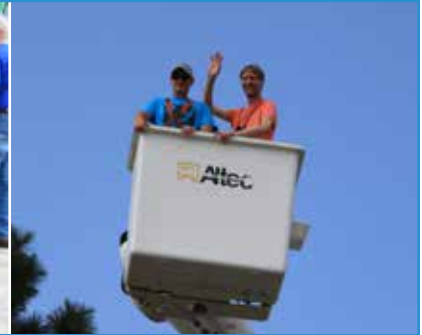
Save the date for Member Appreciation Day • July 17