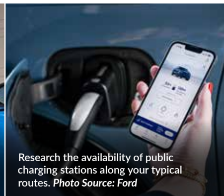
Research the availability of public charging stations along your typical routes.