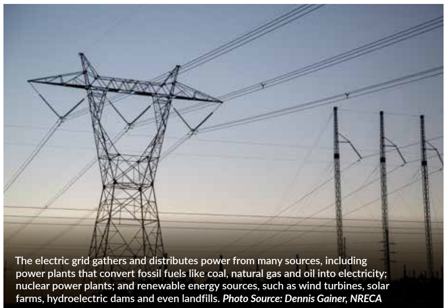
The electric grid gathers and distributes power from many sources, including power plants that convert fossil fuels like coal, natural gas and oil into electricity; nuclear power plants; and renewable energy sources, such as wind turbines, solar farms, hydroelectric dams and even landfills.

Scott Flood writes on a variety of energy-related topics for the National Rural Electric Cooperative Association, the national trade association representing nearly 900 electric co-ops.