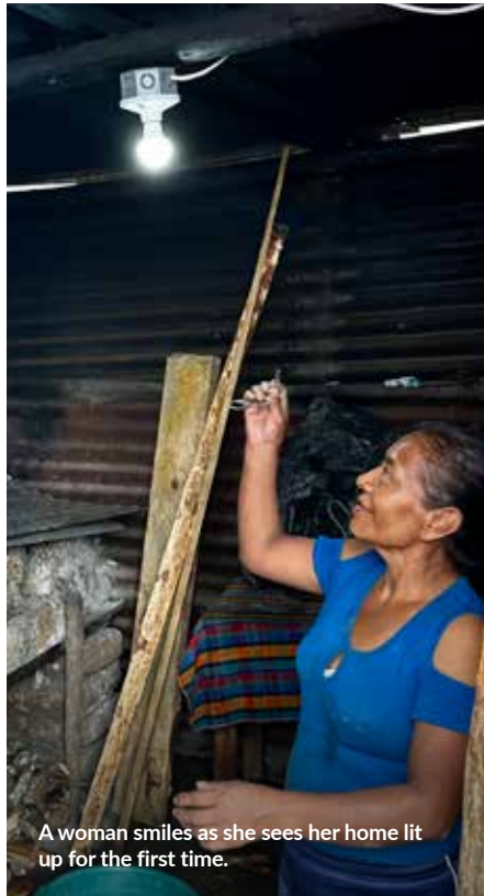
A woman smiles as she sees her home lit up for the first time.

The Minnesota Rural Electric Association, along with Iowa Association of Electric Cooperatives, helped organize the project. Photos and videos from the work are available by joining the dedicated Facebook group 2024 Powering a Brighter Future in Guatemala .