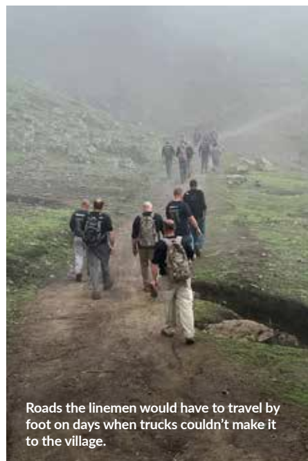
Roads the linemen would have to travel by foot on days when trucks couldn't make it to the village.

This institution is an equal opportunity provider and employer.