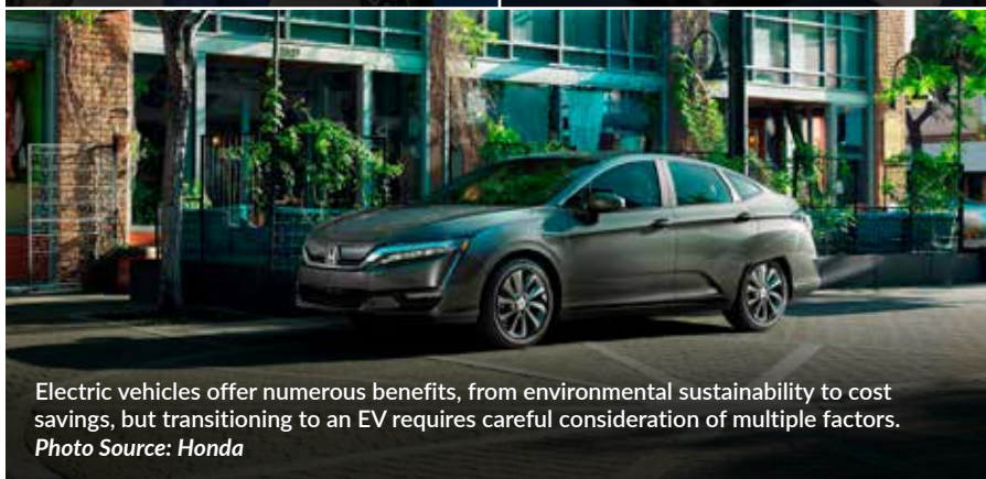
Electric vehicles offer numerous benefits, from environmental sustainability to cost savings, but transitioning to an EV requires careful consideration of multiple factors.

Maintenance: EVs typically require less maintenance than conventional vehicles, which can lead to long-term savings. EVs have far fewer moving parts than combustion engine vehicles, resulting in a streamlined maintenance experience.