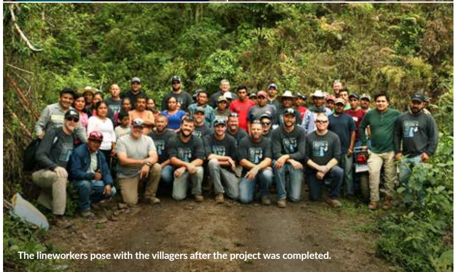
The lineworkers pose with the villagers after the project was completed.