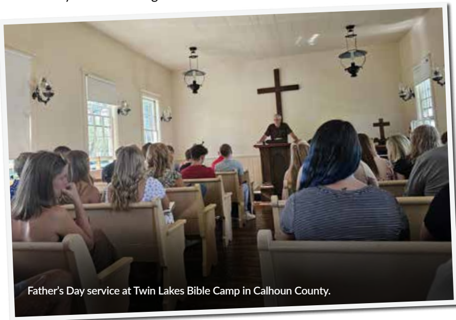
Father's Day service at Twin Lakes Bible Camp in Calhoun County.