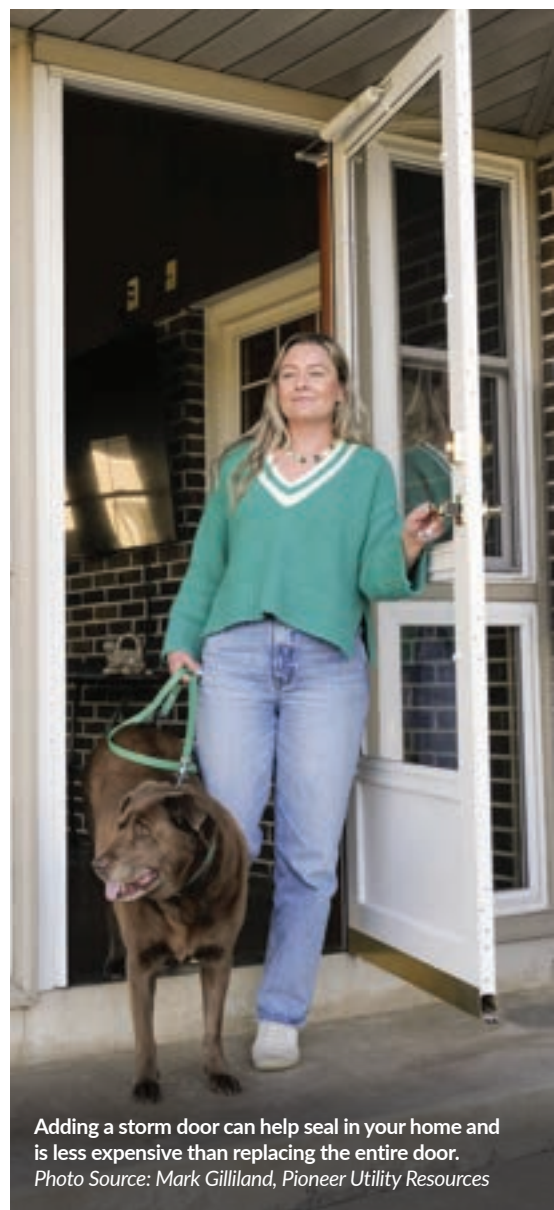
Adding a storm door can help seal in your home and is less expensive than replacing the entire door.