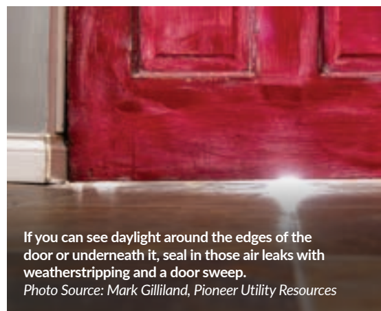
If you can see daylight around the edges of the door or underneath it, seal in those air leaks with weatherstripping and a door sweep.