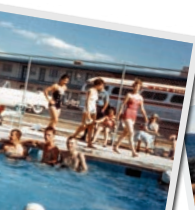
Vintage photos from the 1958 Youth Tour.