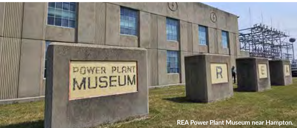
REA Power Plant Museum near Hampton.

When I heard there was going to be a tour of the Rural Electrification Administration (REA) Power Plant Museum near Hampton this summer, I was all in. As I explored the displays in the 85-year-old building, the Delco-Light plant exhibit caught my eye.